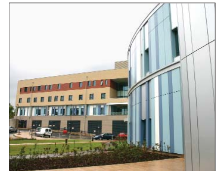
Superlintels with Duragalv 70, for spans up to 6m, were specified to meet minimum 60 years design life for the external envelope at the new PFI University Hospital of North Staffordshire, Stoke

We offer three grades of Duragalv post-galvanised zinc coating (70, 100 and 140 microns) with a stated longevity to suit the full range of design life needs - up to 120 years+ - and regional categories of atmospheric corrosivity. We post-galvanise in-house to ensure quality control of the finish, backed by test certification. We use minimum 4mm thick